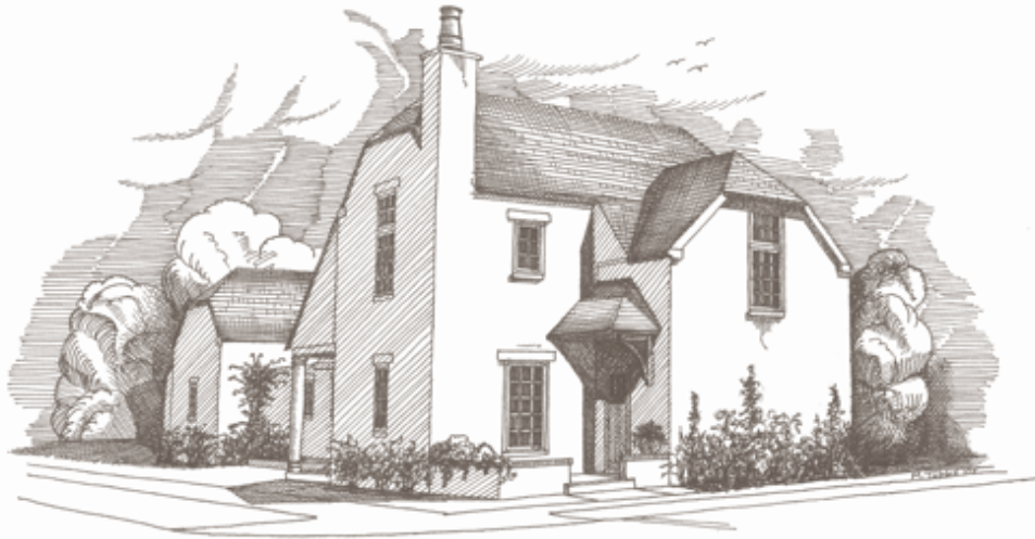
Craven Cottage: Elevation A

Hampstead Cottage, Architect: Geoffery Mouen